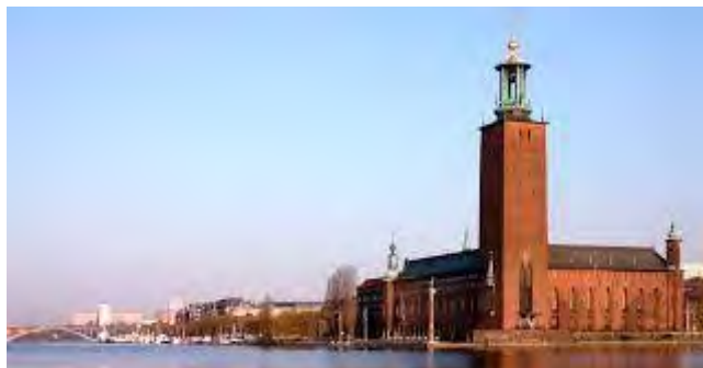
Stockholm City Hall