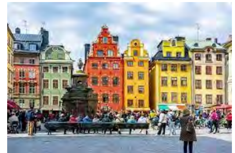
Old Town Stockholm