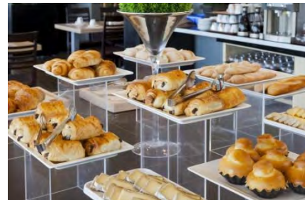
Hotel Mercure Paris 19 Philharmonie La Villette