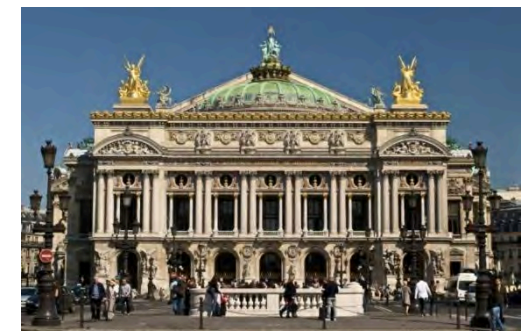
Place de l'Opéra Garnier