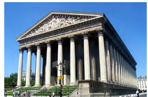
L'église de la Madeleine