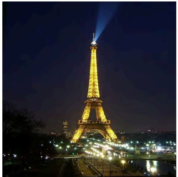
Paris evening city view