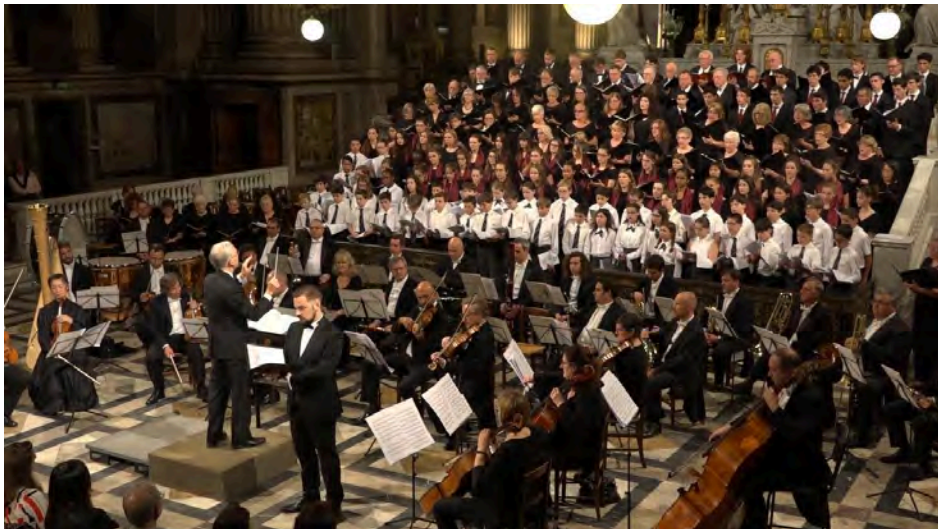
American and French choral artists perform Fauré's Requiem in La Madeleine in Paris on June 12, 2018, conducted by Earl Rivers