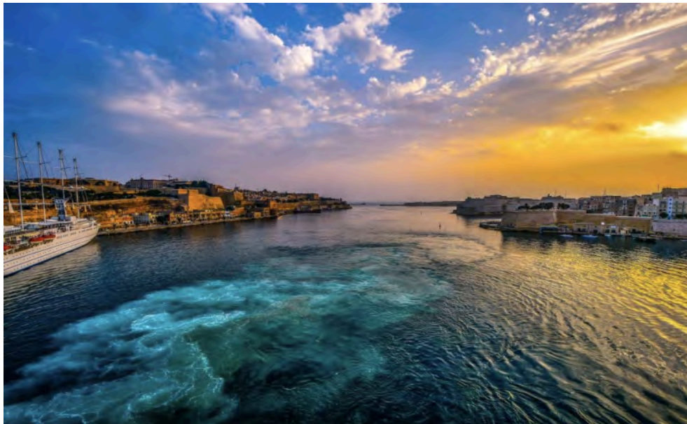
The Grand Harbour