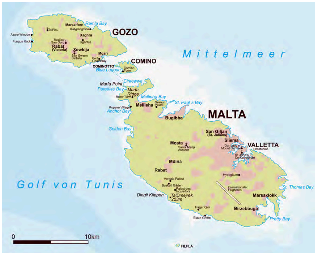
The Islands of Malta & Gozo