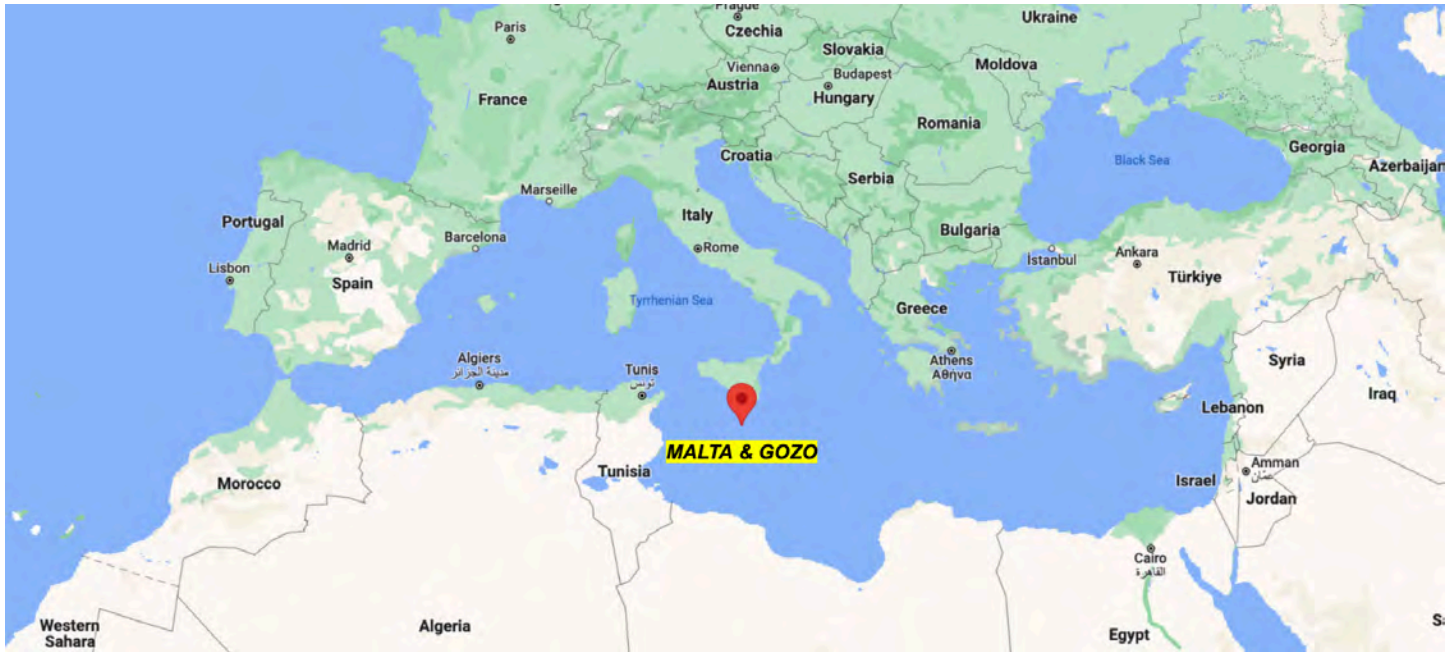
The Islands of Malta & Gozo in the Mediterranean Sea