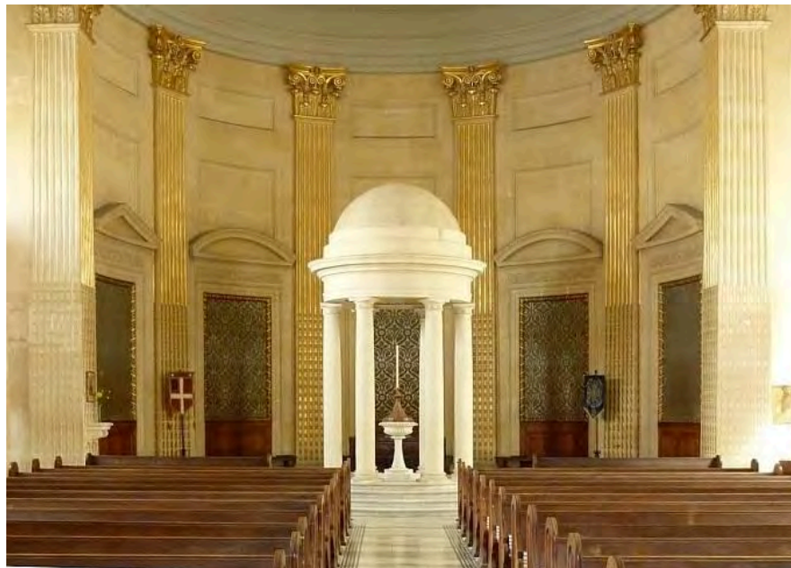
Interior of St. Paul's Pro-Cathedral (site of the a cappella solo performances)