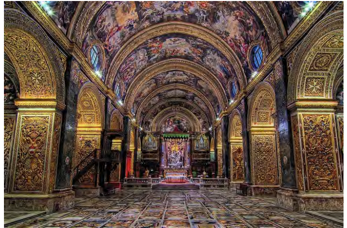
Saint John's Co-Cathedral

During our tour of Valletta - the present-day capital of Malta - our guide will unfold the history of this magnificent city built by the Knights of St. John during the 16th and 17th centuries. Valletta is often referred to as one big open-air museum with something different around every corner.