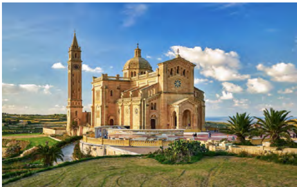
The Basilica of the Blessed Virgin Of Ta' Pinu

We will, then, proceed to the Bay of Marsalforn and discover some of Gozo's natural sites, including a plateau from which ancient salt pans and the beautiful natural bays of Xwejini and Qbajjar are visible.