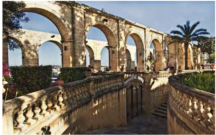
Upper Barrakka Gardens