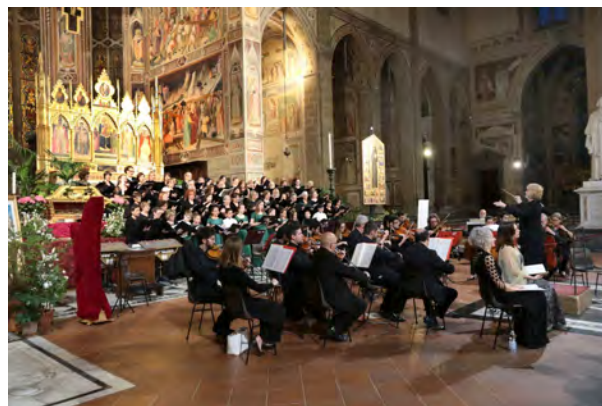
MidAm International, Inc. performances in Florence in 2019