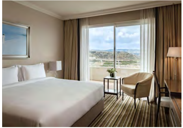
Radisson Blu Resort & Spa, Malta Golden Sands