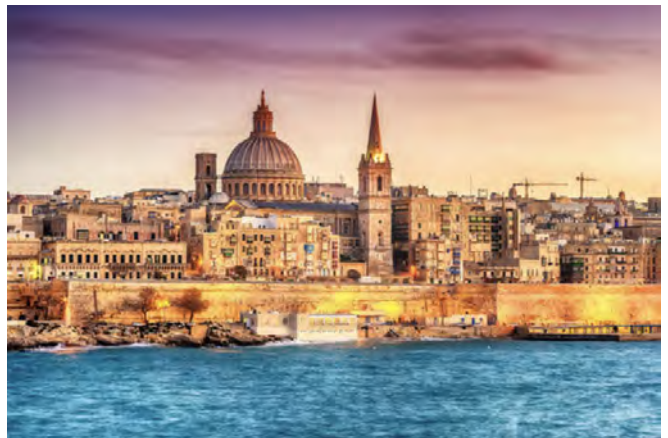
Valletta by day and night