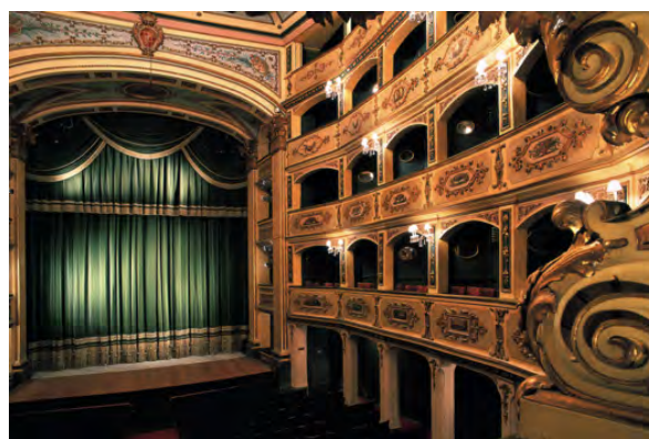
Interior of the historic Manoel Theatre of 1731