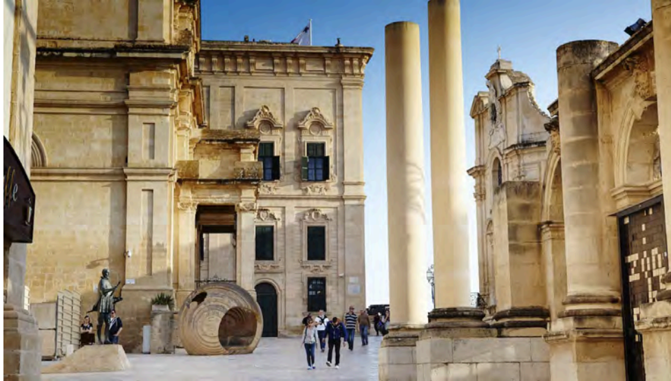
Pillars Of Royal Opera House On Pjazza Teatru Rjal