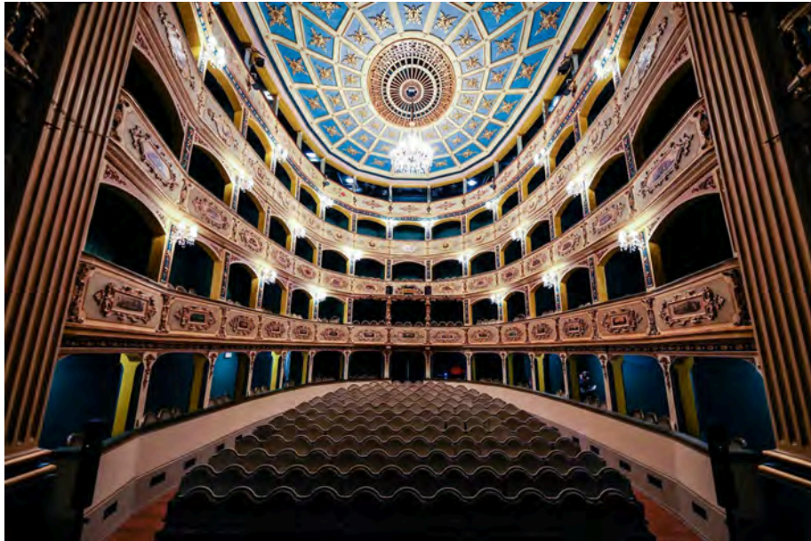
Interior of the Manoel Theatre