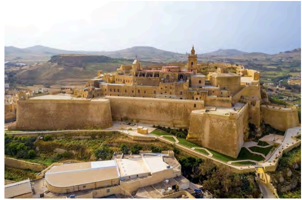
The Citadel of Victoria