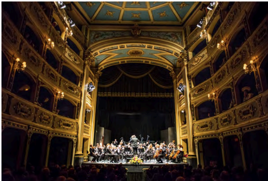
Site of Mozart's Requiem on July 5, 2024