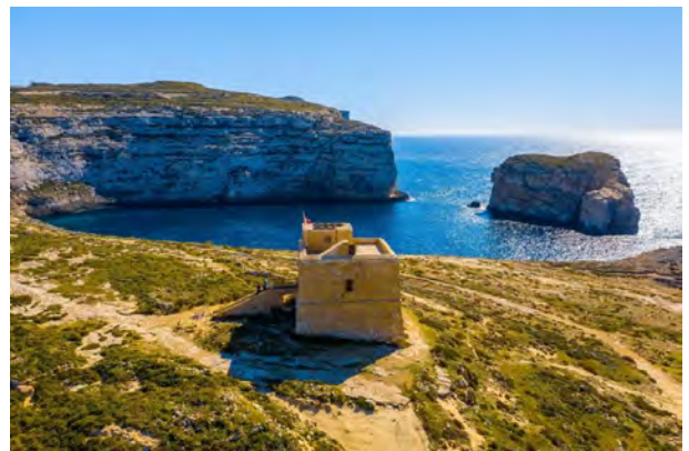
Dwejra Bay & the Admiral's Rock