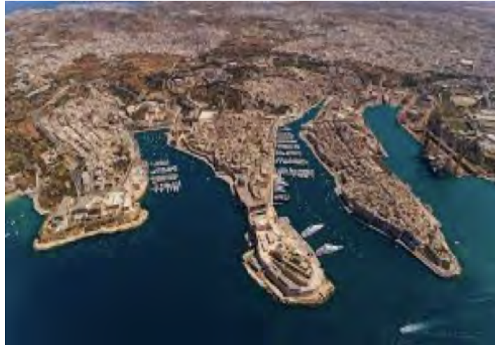
Kalkara, Birgu and Senglea

South of Valletta, Senglea, Cospicua and Vittoriosa form part of the magnificent Grand Harbour. These cities have endured the Great Siege of 1565 against the might of the Ottoman Empire and endless bombardments during World War II. This short, half-day tour is an introduction to these unique cities, their history, heritage and people.