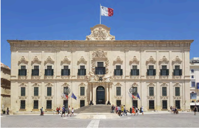
Auberge de Castille in Valletta

We will also have some free time to enjoy more of the city's landmarks at our own pace. These include the remains of the Old Opera House, the new Renzo Piano Parliament building, and St. James' Cavalier and Our Lady of Victories Church.