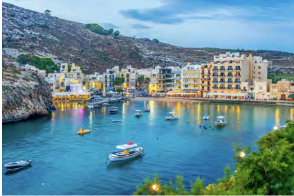
Xlendi Bay at night