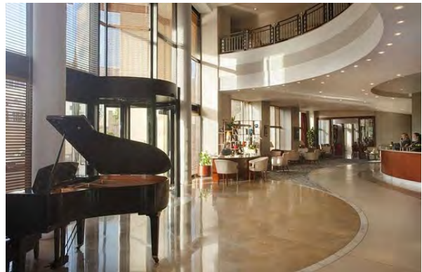
Marina Hotel Corinthia Beach Resort