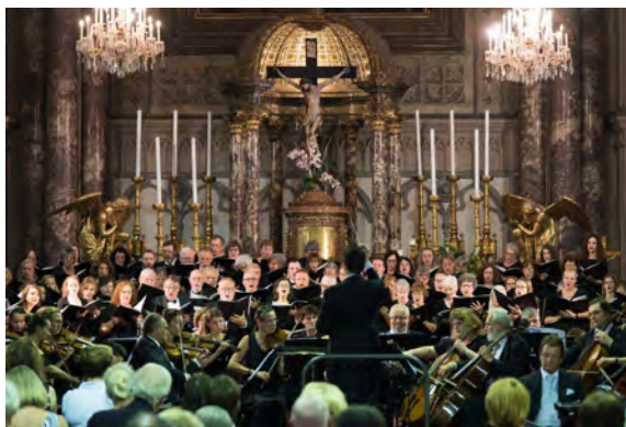
MidAm International, Inc. performances in London (2023), Paris (2019) and Vienna (2019)