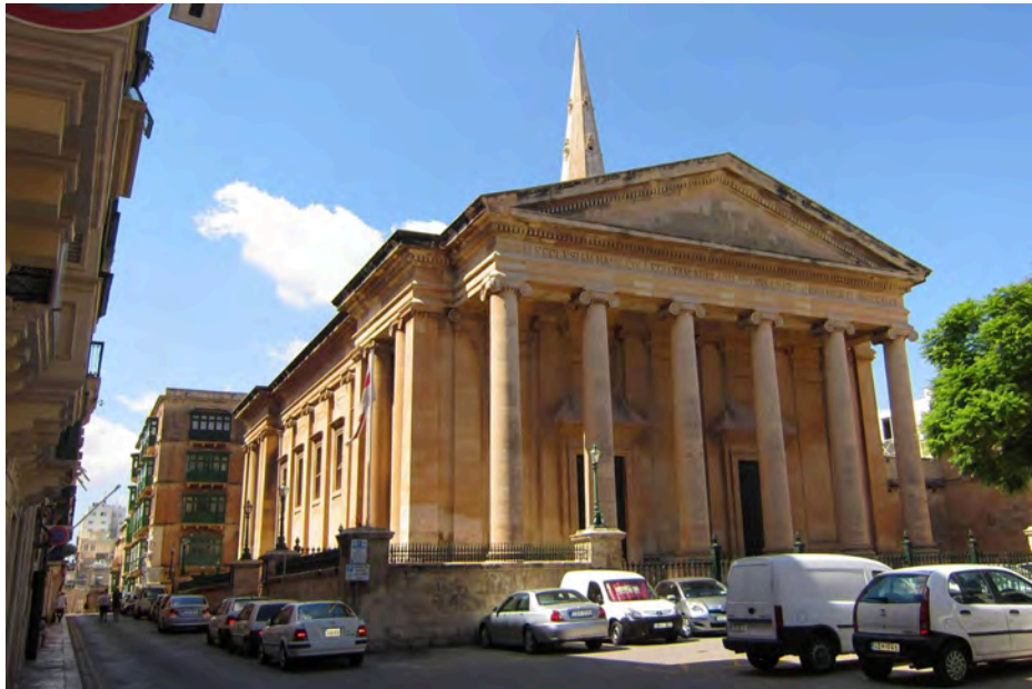
St. Paul's Pro-Cathedral