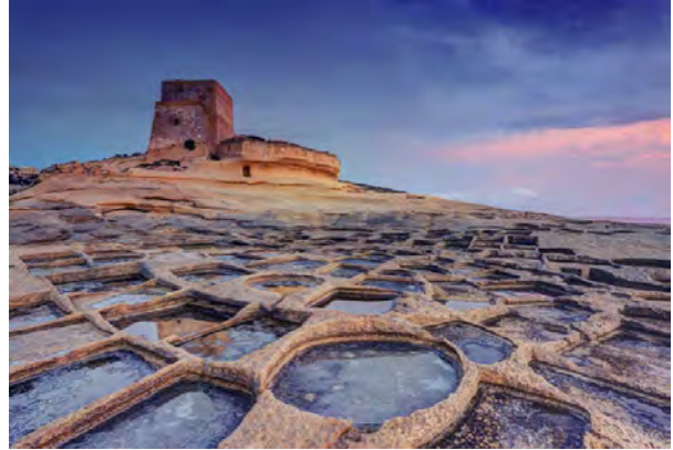
Sunrise at Xwejini Bay and Salt Pans

We will drive to the Cirkewwa terminal, located in the north of Malta, to board our ferry for a 25-minute ferry crossing to the island of Gozo. During the crossing, you will pass the smaller island of Comino and will notice, atop the high, rugged cliffs, the Santa Maria Fort, used in the 2002 movie Count of Monte Cristo. Upon arrival, we will join the guide and tour transport for our tour of Gozo.