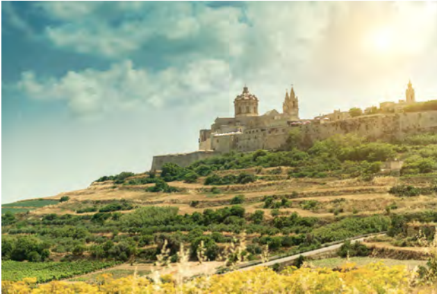
Mdina - The Silent City