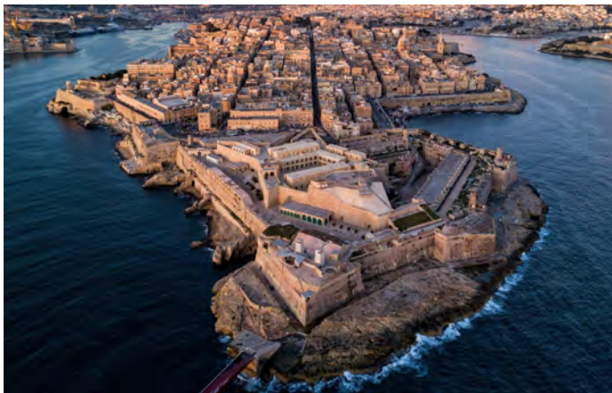
Fort St. Elmo