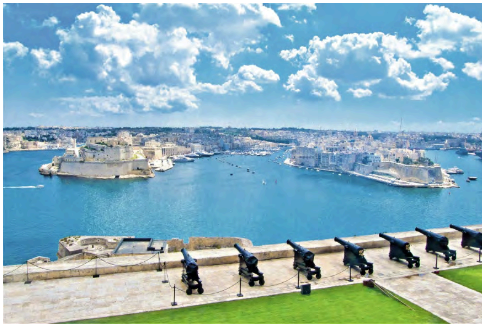
The "Saluting Battery" of Fort Lascaris

We will also embark on a 90-minute Grand Harbour Cruise on board a brand-new, eco-friendly, fully-air-conditioned, state-of-the-art, 33-meter Catamaran, which will take us back in time to relive Malta's gallant history, cruising around the two natural harbors on either side of Valletta - Marsamxetto Harbour and the Grand Harbour. Here, you will experience the past and view the magnificent forts, battlements and creeks situated in Valletta and the Three Cities. A detailed commentary in English will unfold the history connected with the two Great Sieges of 1565 and 1942, as well as other places of interest which can only be admired from the sea.