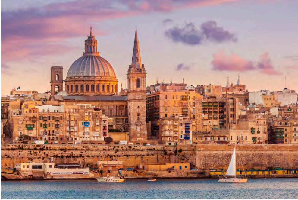
Valletta's cityscape and colorful streets