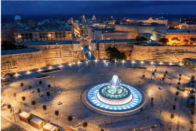
Tritons' Fountain outside the City Gate of Valletta