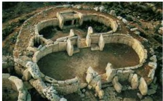
The Ggantija temples