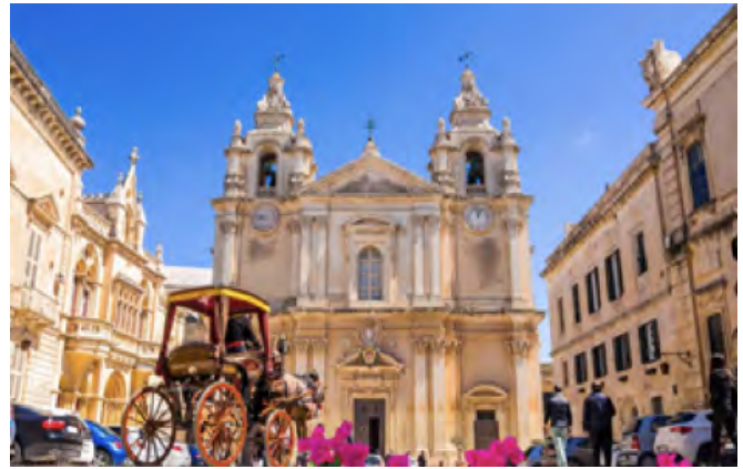
St. Paul's Cathedral, Mdina

This tour includes some of central Malta's highlights. Our first stop includes a visit to the town of Mosta. Dominating the central piazza is the Rotunda church, more commonly known as Mosta Dome. Its large dome is the fourth largest unsupported dome in Europe. For many visitors, the most fascinating feature of this church is its survival of a World War II air raid and a bomb that pierced the dome and fell inside the church during a service attended by 300 locals. The bomb failed to explode and the locals hailed the event as a miracle. The church sacristy chronicles the events and houses a replica of the bomb, as well as the World War II shelter.