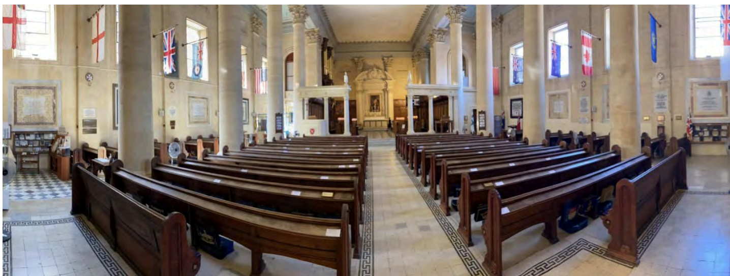
Interior of St. Paul's Pro-Cathedral