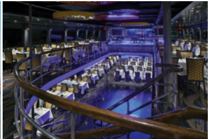
The Spirit of New York