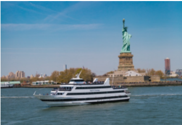
The Spirit of New York at the Statue of Liberty

In determining if registering ensembles qualify for complimentary packages or a group credit, registrants taking the $499 non-performer package are not counted.