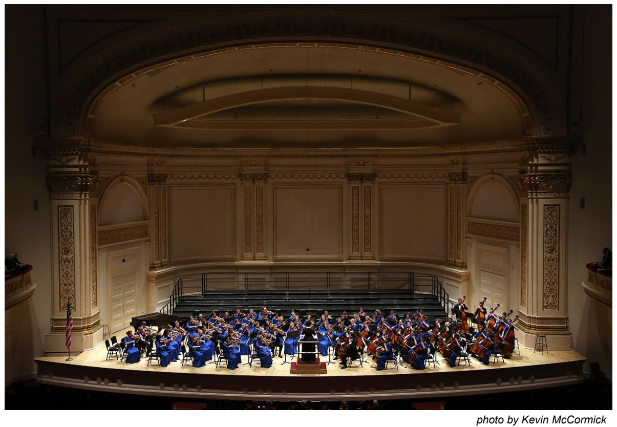
Port Angeles High School Symphonic Orchestra takes the stage in Stern Auditorium / Perelman Stage at Carnegie Hall