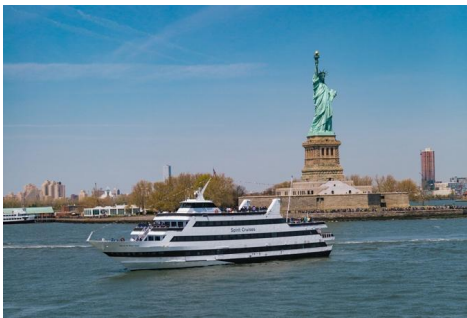
The Spirit of New York at the Statue of Liberty