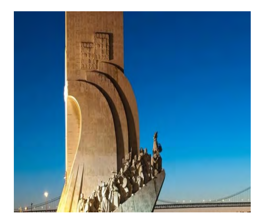
Tower of Belem Jerónimos Monastery Monument of the Discoveries