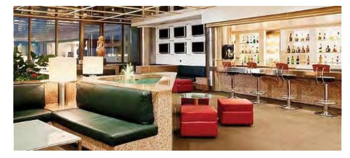
Hotel Holiday Inn Lisbon Continental