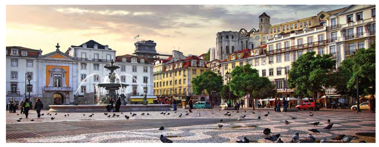
Bairro Alto and Chiado