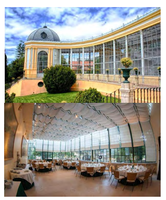
Restaurant Estufa Real Lisbon