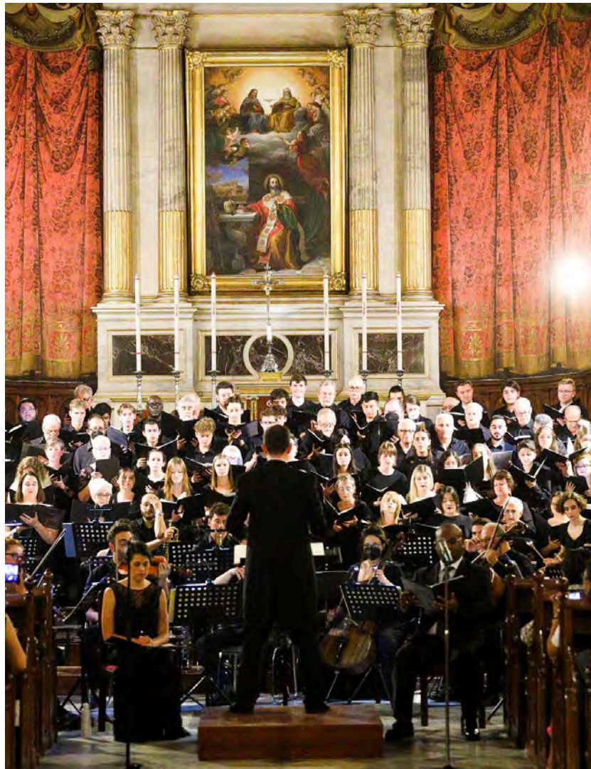
Conductor Scott Glysson, Athens Philharmonia Orchestra and Participating Choirs in Cathedral Basilica of St. Dionysius the Areopagite, Athens, Greece, Wednesday, July 13, 2022

Hotel is located a 5-minute walk from the Syros port. The MidAm team will pick up all luggage and drop off at the port.