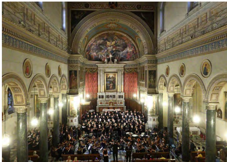
Cathedral Basilica of St. Dionysius the Areopagite

The 10-day/9-night residency cost is $3825 per person, based on double occupancy (see pages 8 & 9 for inclusions & exclusions). The initial registration, with a deposit of $400 per person, is due November 15 to December 1, 2024