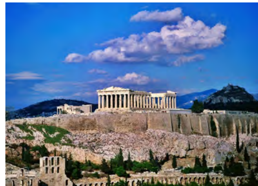
Acropolis Tour With Visit to the Parthenon