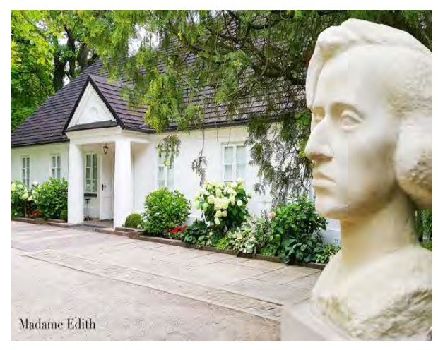
The Chopin House