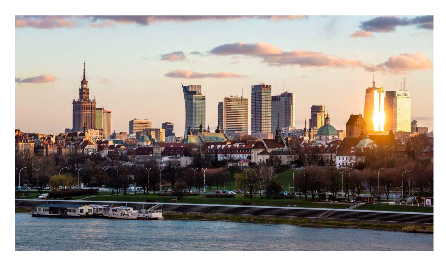
Warsaw and Vistula River