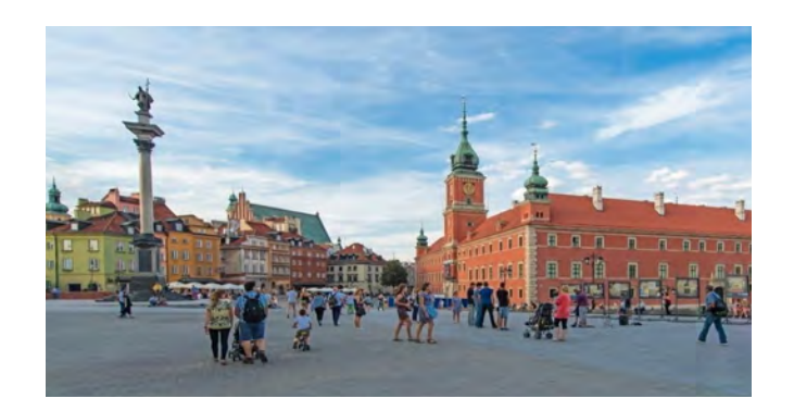
Royal Route - St. Anna's Church

<u>First Tour:</u> General Warsaw Tour Panoramic city-sightseeing includes the most interesting and important tourist attractions of the city: The Royal Route with superb aristocratic residences, churches and famous monuments, Presidential Palace, statue of Copernicus, Holy Cross Church (interment site of the heart of Fryderyk Chopin), Warsaw University, Old Town (UNESCO World Heritage Site with Royal Castle), St. John's Cathedral Market Square, Barbican, New Town with monument of the Warsaw Uprising of 1944, former Jewish Ghetto area with Memorial to the Heroes of the Ghetto Uprising, and the Tomb of the Unknown Soldier plus the Praga District, and BUW Botanic Gardens, <a href="https://warsawtour.pl/en/the-praga-district/">https://warsawtour.pl/en/the-praga-district/</a>