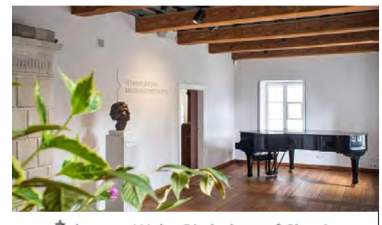
Żelazowa Wola: Birthplace of Chopin