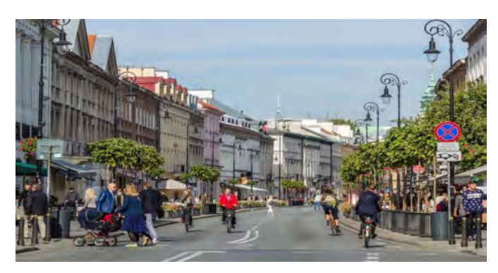
Royal Route - Krakowskie Przedmieście Street