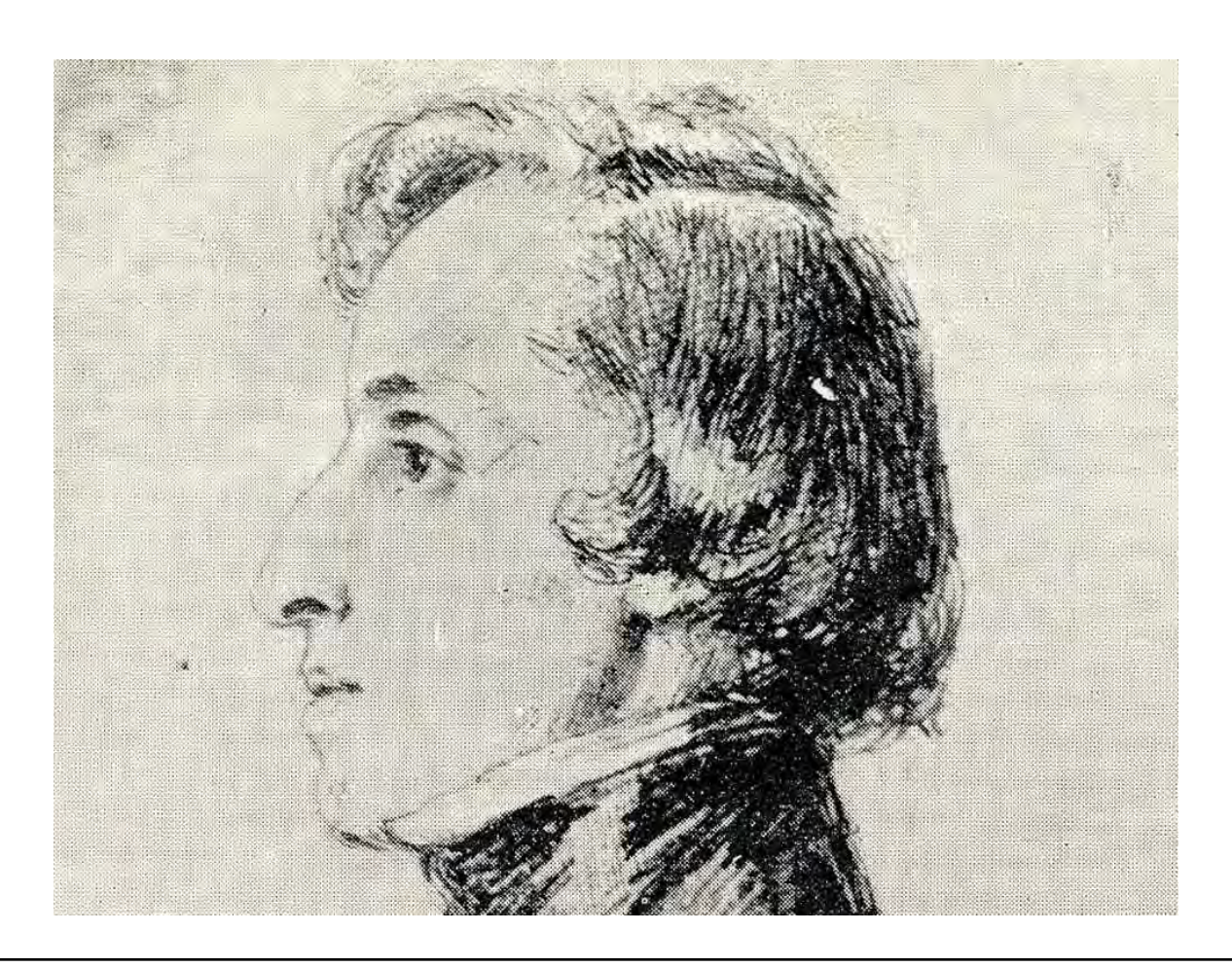
Born-March 1, 1810-Died-October 17, 1849